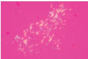
Crystals of Gout

Collected fluid should immediately be placed into appropriate containers and analyzed expeditiously. Check with your laboratory regarding specific submission procedures (e.g., the correct tubes and the volume of fluid required for each test) at your institution. If only minute volumes of synovial fluid are obtained, discussions with laboratory personnel are indicated to prioritize testing. As little as one drop of fluid may be sufficient for crystal analysis, and 1 ml may suffice for a cell count and a differential count. 4