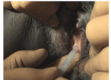
Figure 5. Guiding the Catheter.