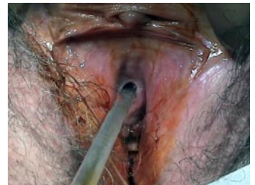
Figure 2. Advancing the Catheter.